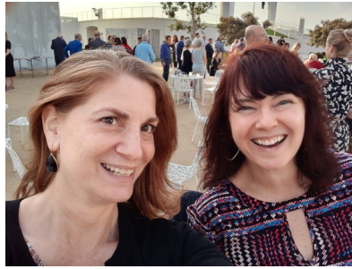
We only took our masks down to snap this photo!