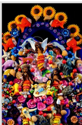
Fantasy Ocean Nativity